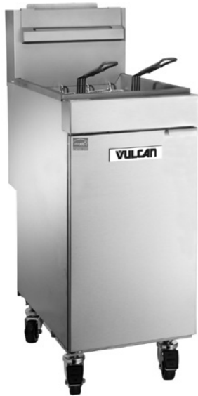
Model 1VEG35M Shown with caster accessories