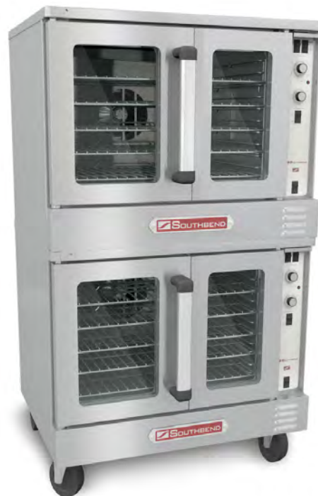
(SLGS/22SC shown with optional casters)