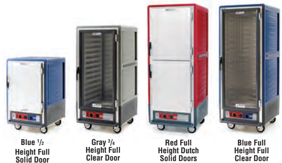
Blue ½ Height Full Solid Door