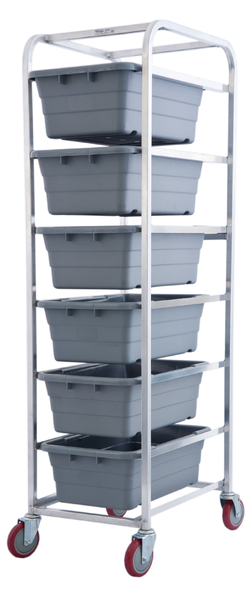
AL-L-6 Equipped with gusset legs for extra strength.