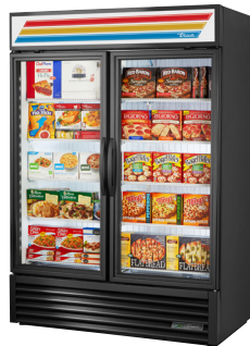
Optional Black Exterior