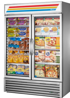
Optional Stainless Exterior