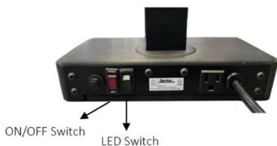
Figure 1. Switches on Back of Base

To adjust the height of the lamp, simply grasp the stem of the lamp and/or the loop end caps of the shade and manually move the shade. The iLume is designed to hold any manually manipulated position.