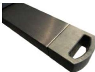
Figure 2. Loop End Caps

NOTICE: Lowering the height of the lamp will increase the heat transferred to the food. Increasing the height of the lamp will decrease the heat transferred to the food.