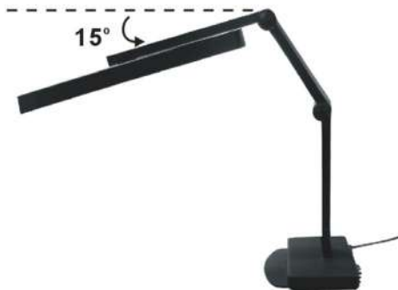
Figure 5. Lamp Shade Tilted to the Horizontal