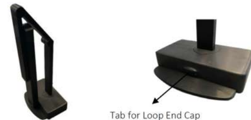
Figure 7. Folded Position Figure 8. Tab on Front of Base

To easily transport or store the iLume, ensure the shade of the lamp is parallel to the stem and manually manipulate the lamp until it is in the folded position shown below in Figure 7. The loop end cap closest to the base will fit around the tab located in the front of the base to help keep the unit in the folded position. See Figure 8 for reference.