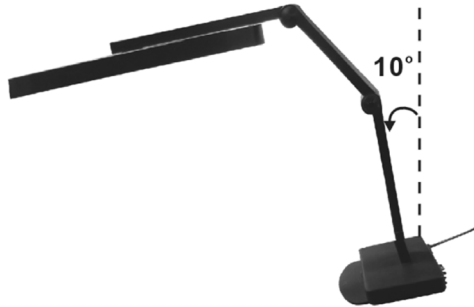
Figure 4. Vertical Stem Tilted to the Vertical