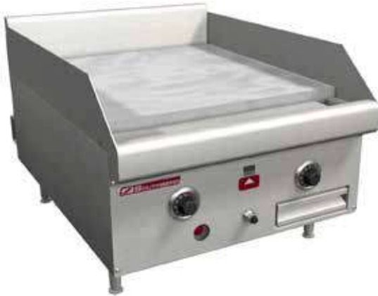
Model shown Model HDG-24