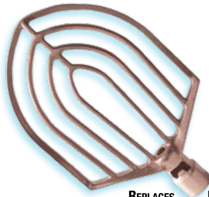
FLAT BEATERS or PADDLES ("B" STYLE)

* indicates a brass insert for longer life