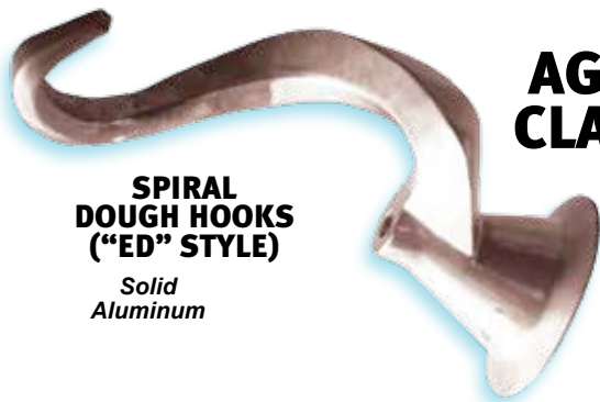
SPIRAL DOUGH HOOKS ("ED" STYLE)

Not for Legacy models, these attachments TWIST into place. An Item with an "A" indicates that it is an Adaptable accessory (i.e., can be used on some different size mixers).