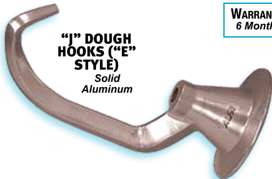
"J" DOUGH HOOKS ("E" STYLE)