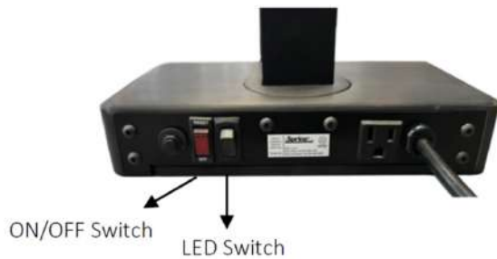
Figure 1. Switches on Back of Base

To adjust the height of the lamp, simply grasp the stem of the lamp and/or the loop end caps of the shade and manually move the shade. The iLume is designed to hold any manually manipulated position.