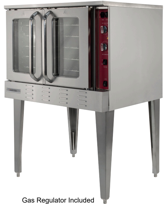
Gas Regulator Included

Kintera Gas Cooking Equipment is warranted to be free from defects in material and workmanship under normal use and service for a period of 1 year from the date of original purchase.