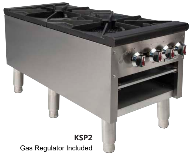
KSP2 Gas Regulator Included