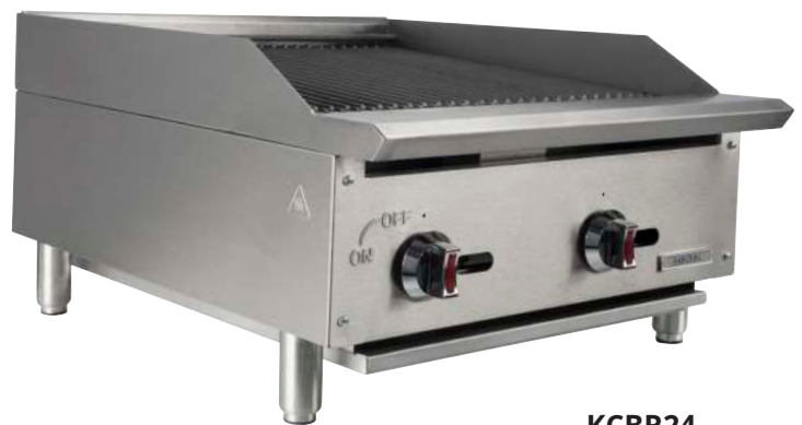
KCBR24 Gas Regulator Included

Kintera Gas Cooking Equipment is warranted to be free from defects in material and workmanship under normal use and service for a period of 1 year from the date of original purchase.