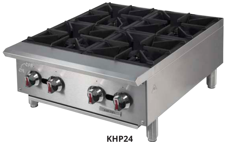
KHP24 Gas Regulator Included

All Countertop Gas Ranges carry ETL gas and sanitation approvals that meet US gas and sanitation requirements for use in restaurants.