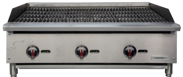
KCBR36 Gas Regulator Included

Kintera Gas Cooking Equipment is warranted to be free from defects in material and workmanship under normal use and service for a period of 1 year from the date of original purchase.