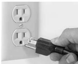
Fig. 6-1 Correct

THIS MACHINE IS PROVIDED WITH A THREE-PRONG GROUNDING PLUG. THE OUTLET TO WHICH THIS PLUG IS CONNECTED MUST BE PROPERLY GROUNDED. IF THE RECEPTACLE IS NOT THE PROPER GROUNDING TYPE, CONTACT AN ELECTRICIAN. DO NOT UNDER ANY CIRCUMSTANCES CUT OR REMOVE THE THIRD GROUND PRONG FROM THE POWER CORD OR USE ANY ADAPTER PLUG (Fig. 6-1 and Fig. 6-2).