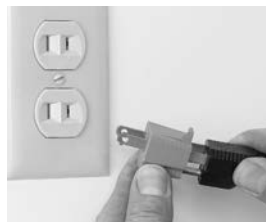
Fig. 6-2 Incorrect