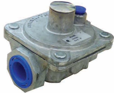
R48P42-0512-10/R48P32-0512-10 (1/2 PSIG Gas System)

Gas appliance regulators are designed for main burner and/or pilot applications, where precise control of tiny flows is an essential operating requirement. Housings are high strength aluminum castings and all models have been tested for multi-position and may be installed in any plane or angle without restriction.