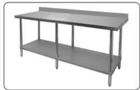
* 72" and up models have 6 legs