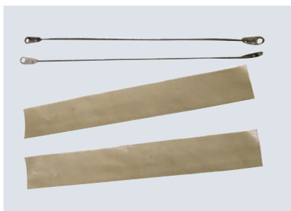
Element Service Kit* (Includes 2 wires and 2 strips)